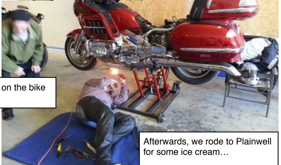
Afterwards, we rode to Plainwell for some ice cream...